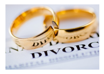
The 21 jobs that are MOST likely to lea to divorce