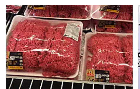
American Shoppers Should Think Twice Before Buying From These 2 Stores.