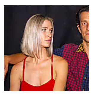
The Most Common Way ( Caught (Brace Yourself) Sponsored | www.peoplewhiz.com

New Jersey: Don't Pay More than $10/Month for Cable & Internet Perform A Simple Search On The Next Page To See Internet Plan Prices Near You Sponsored | $10 Internet Plan Ads