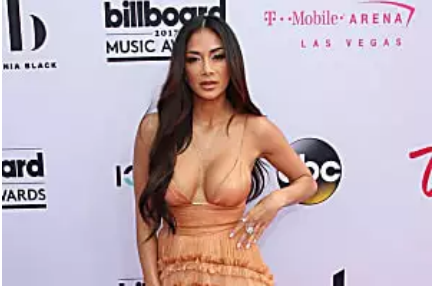
[Photos] 25 Of The Most Inappropriate Dress on The Red Carpet Sponsored | Definition