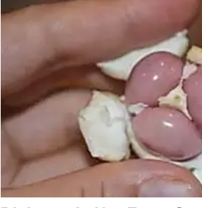
Diabetes Is Not From Swe The Main Enemy Of Diabe