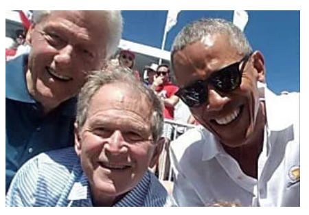
6 Things Former Presidents Aren't Allowed To Do After Office